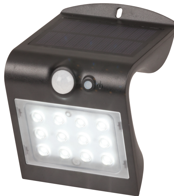
220 Lumen Solar Rechargeable Wall Light with PIR Sensor SL-3512 User Manual